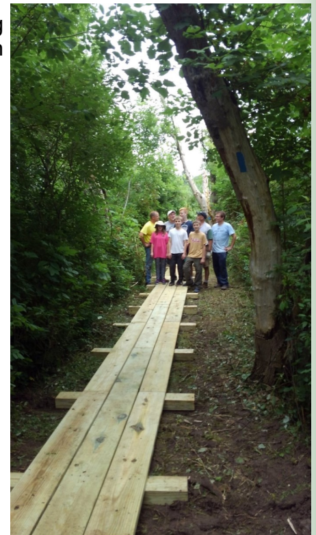
Andrew's boardwalk in Lehigh Crossing Park on the Trolley Trail.