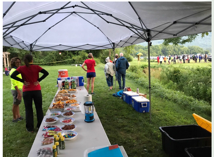
Twisted Branch aid station all set for the competitors.

We have also participated in several events to display pictures and maps of our trails. In June it was National Trails Day in Victor and the ADK Outdoor Expo at Mendon Ponds Park. In July it was the OSPF Half Marathon Trail Race on the Seneca and Crescent Trails. In August we supported the Twist Branch 100K Trail Race by manning the aid station in Naples. In September we had a booth at Hang Around Victor