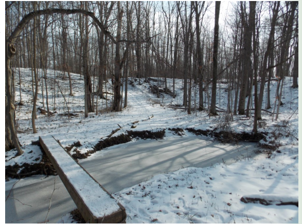
The old temporary bridge. Slippery in the winter.